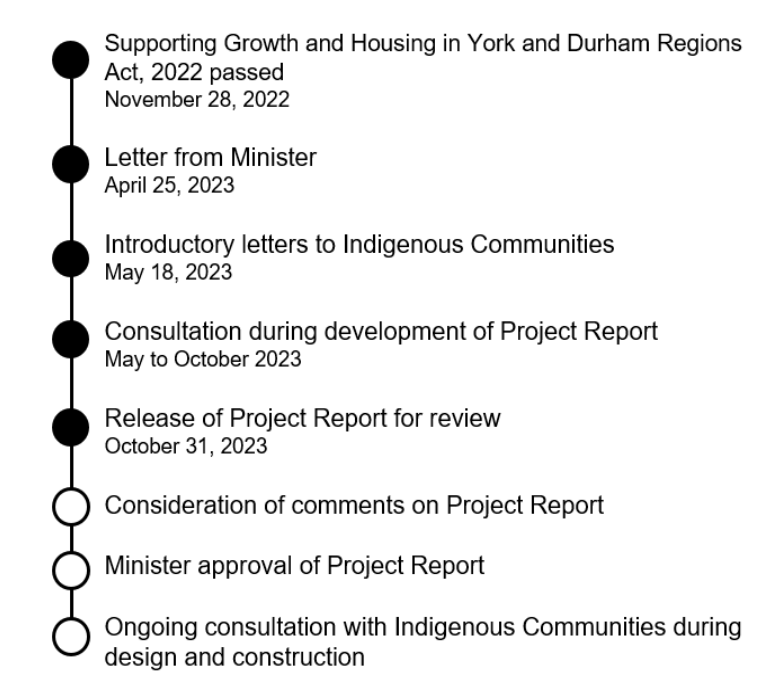
Figure 2.1 Consultation Milestones and Stages