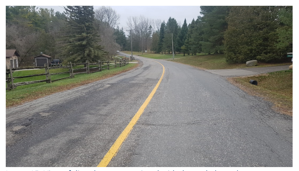
Image 15: View of disturbances associated with the asphalt roadway, intersecting driveways, existing structures, roadside ditching and culverts. Lands beyond the disturbed road ROW retain archaeological potential.