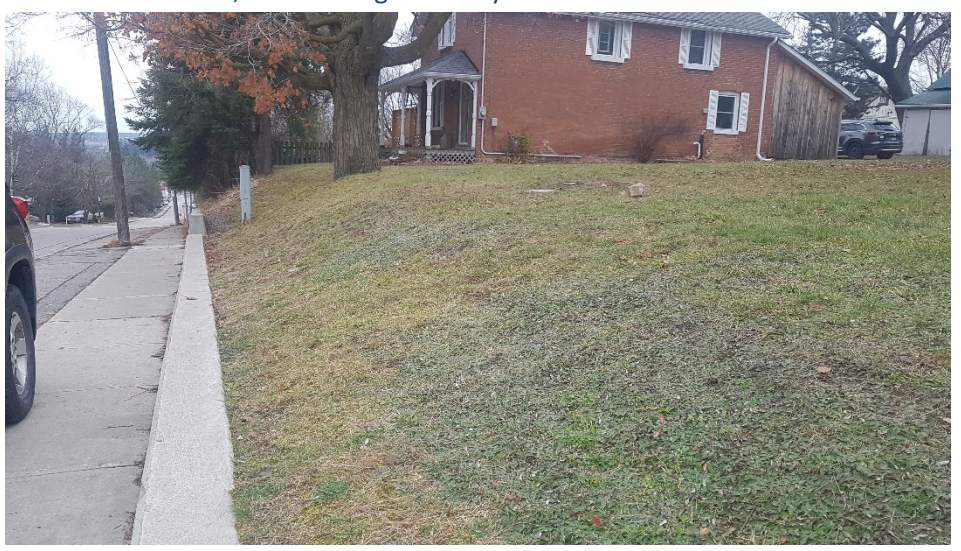
Image 4: View of disturbances associated with a cut slope, concrete sidewalk and barrier, and existing structures adjacent to the Mount Albert Wesleyan Methodist Pioneer Cemetery property limits.