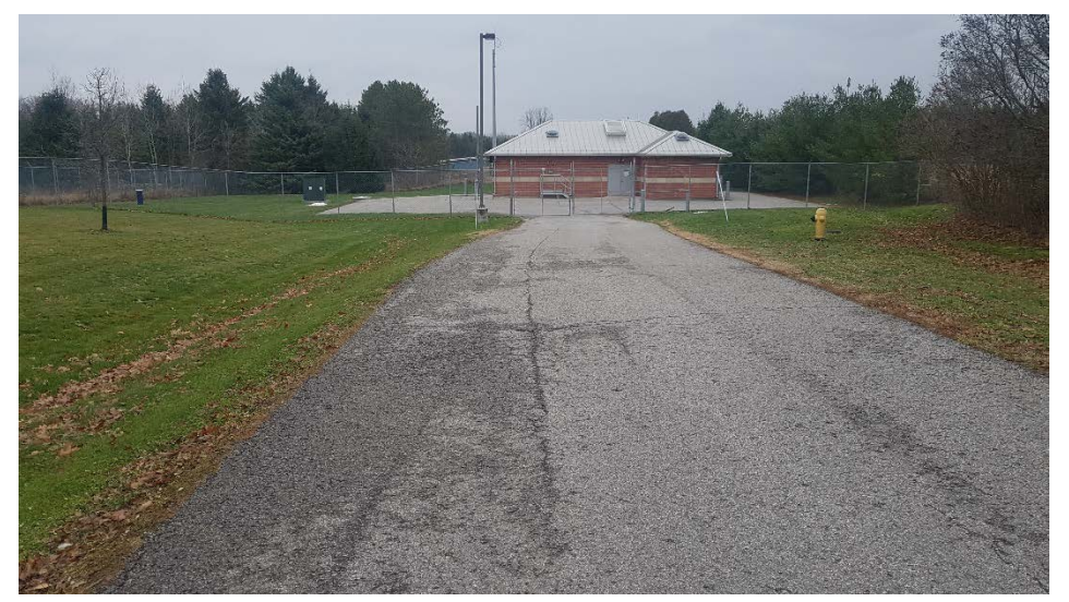
Image 19: View of disturbances associated with regional infrastructure (well 3).