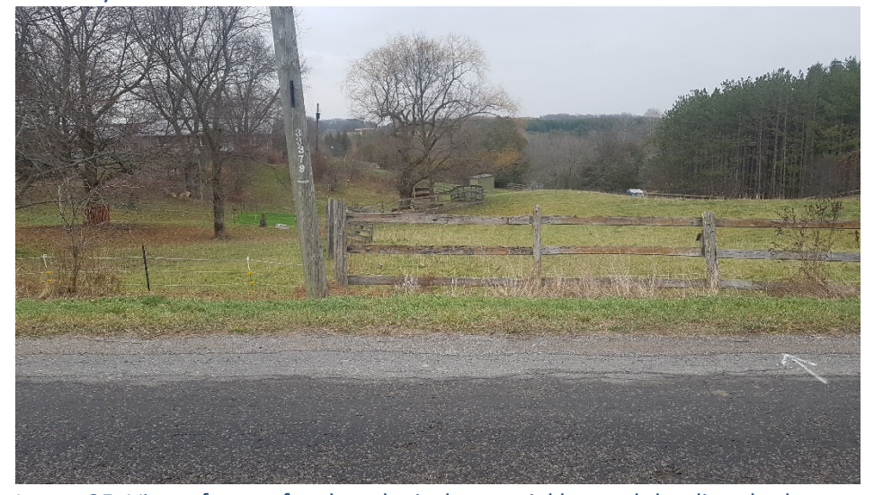
Image 35: View of area of archaeological potential beyond the disturbed ROW. Steeply sloping terrain visible in the background.