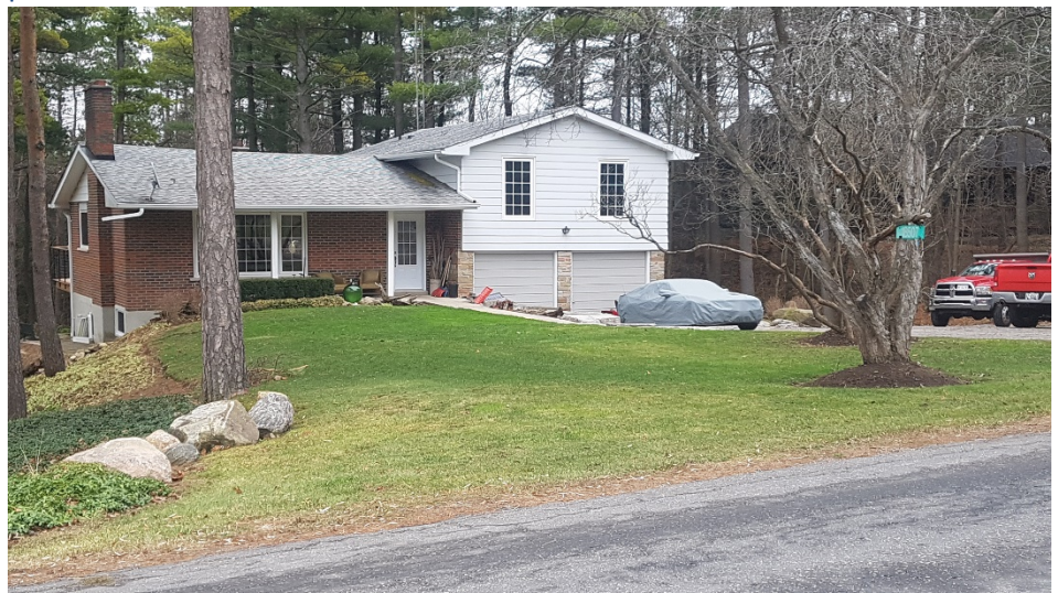
Image 16: View of disturbances associated with a residential structure. Manicured lawn retains archaeological potential.