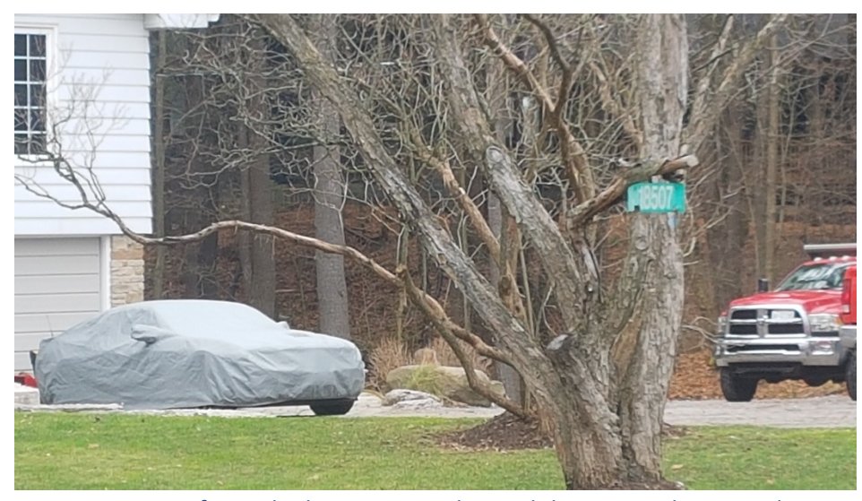
Image 33: View of steeply sloping terrain beyond the existing house and driveway.