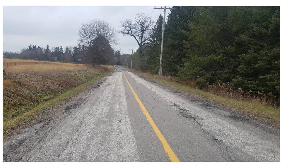
Image 18: View of disturbances associated with the asphalt roadway. Note the cut and embankment of the road bed within the surrounding slightly sloping terrain. Lands beyond the disturbed road ROW retain archaeological potential.