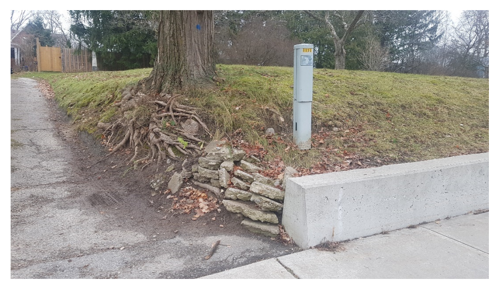
Image 5: View of disturbances associated with a cut slope, concrete barrier, sidewalk, driveway and utilities adjacent to the Mount Albert Wesleyan Methodist Pioneer Cemetery limits.