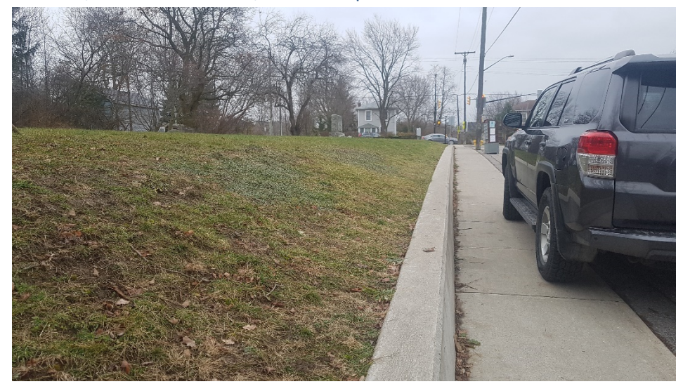
Image 3: View of disturbances associated with a cut slope, concrete sidewalk and barrier adjacent to the Mount Albert Wesleyan Methodist Pioneer Cemetery property limits.