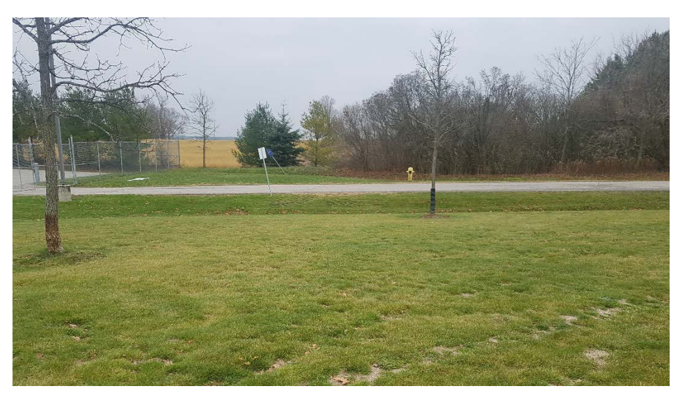
Image 21: View of area subjected to previous grading and construction activities associated with the installation of the well site.