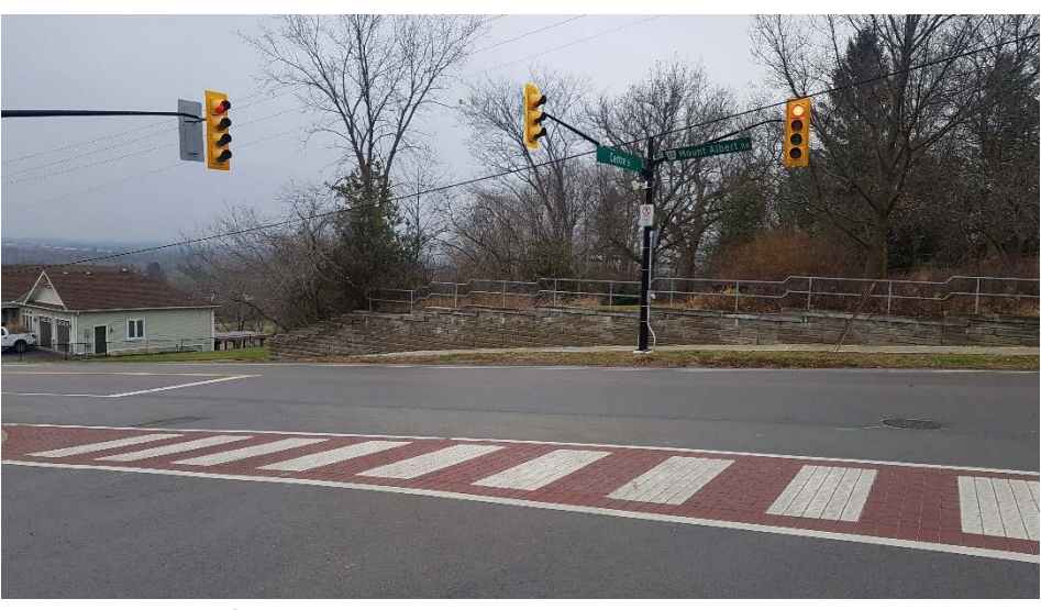
Image 26: View of disturbances associated with a cut slope, barrier wall, and concrete sidewalk adjacent to the Birchard Family Burying Ground.