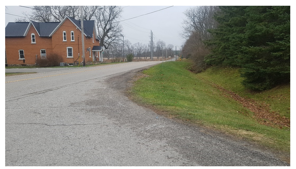
Image 9: View of disturbances associated with the asphalt roadways, gravel shoulders, deep drainage ditching, culverts and a residential structure.