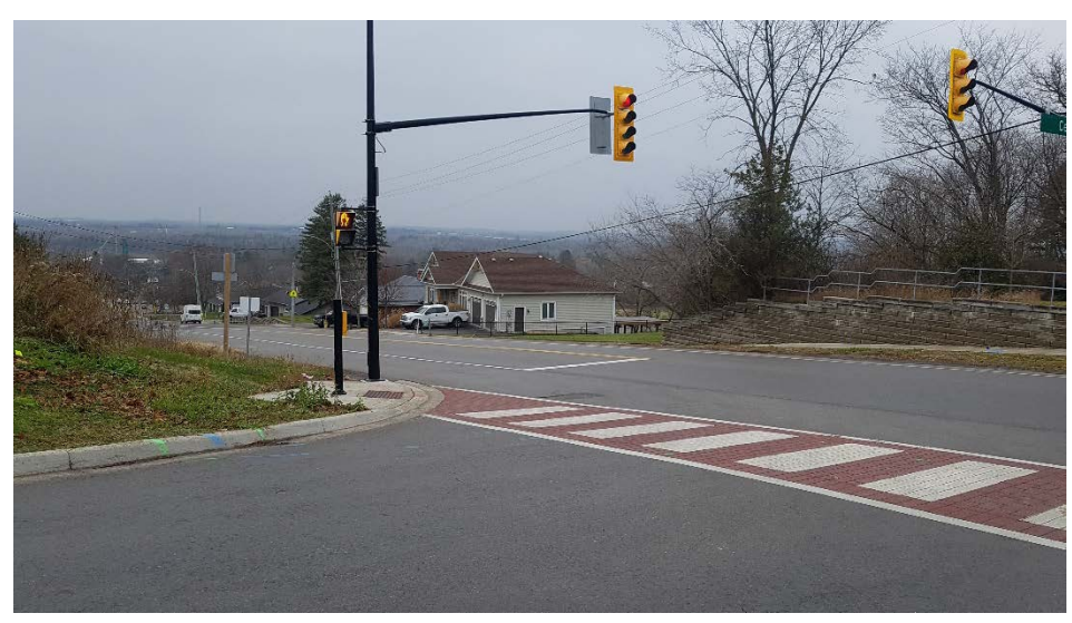
Image 25: View of disturbances associated with previous roadway improvements – asphalt roadway, concrete curbs and sidewalks, buried utilities.