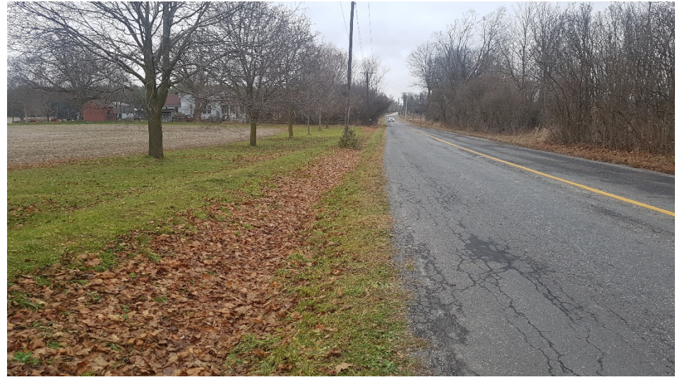
Image 12: View of disturbances associated with the asphalt roadway and roadside ditching. Manicured lawn and agricultural field on the left retain archaeological potential.