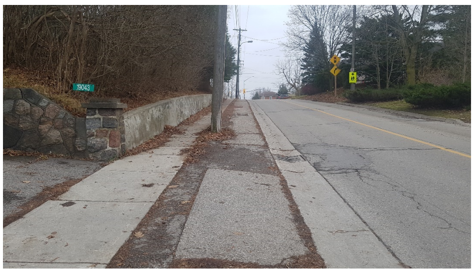
Image 1: View of disturbances associated with the asphalt roadway, concrete shoulder, curbs and sidewalk, and cut slope with concrete barrier.