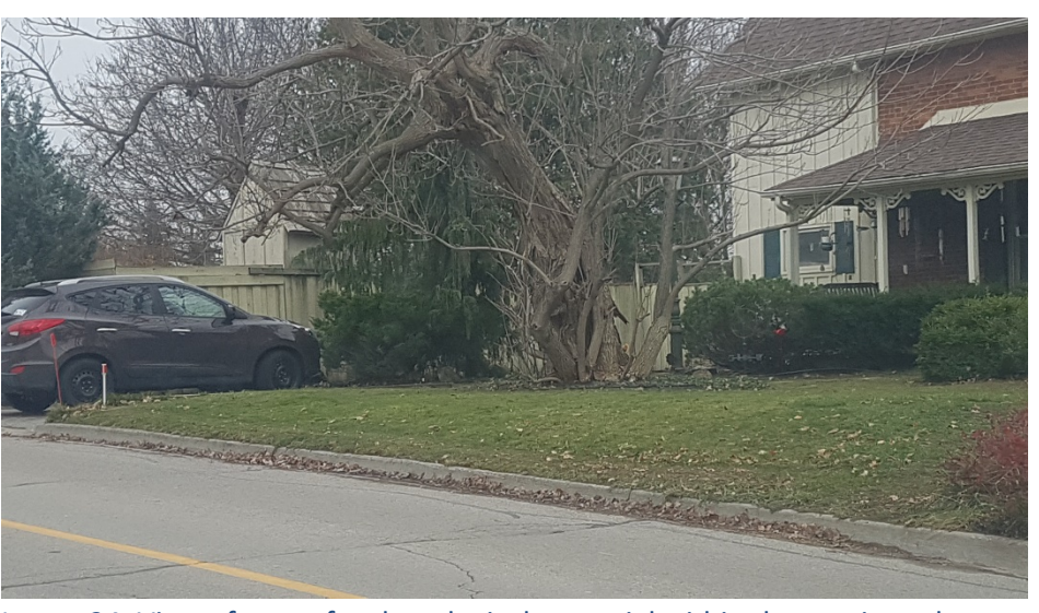
Image 34: View of area of archaeological potential within the manicured front lawn of a residential property.