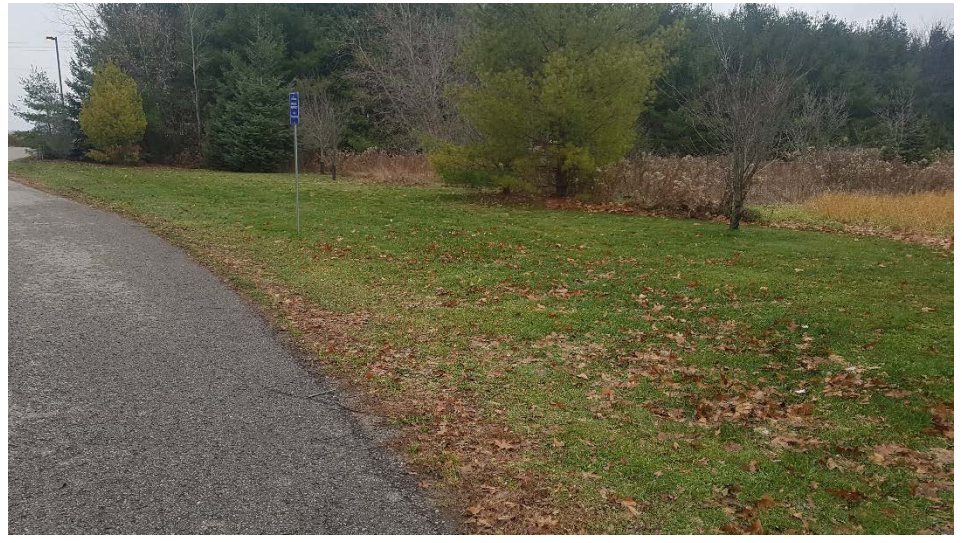
Image 24: View of area subjected to previous grading and construction activities associated with the installation of the well site.