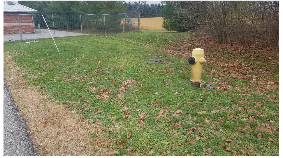
Image 23: View of area subjected to previous grading and construction activities associated with the installation of the well site.