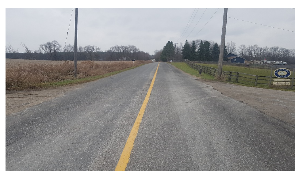
Image 13: View of disturbances associated with the asphalt roadway, intersecting gravel driveways and extant structures. Lands beyond the disturbed road ROW retain archaeological potential.