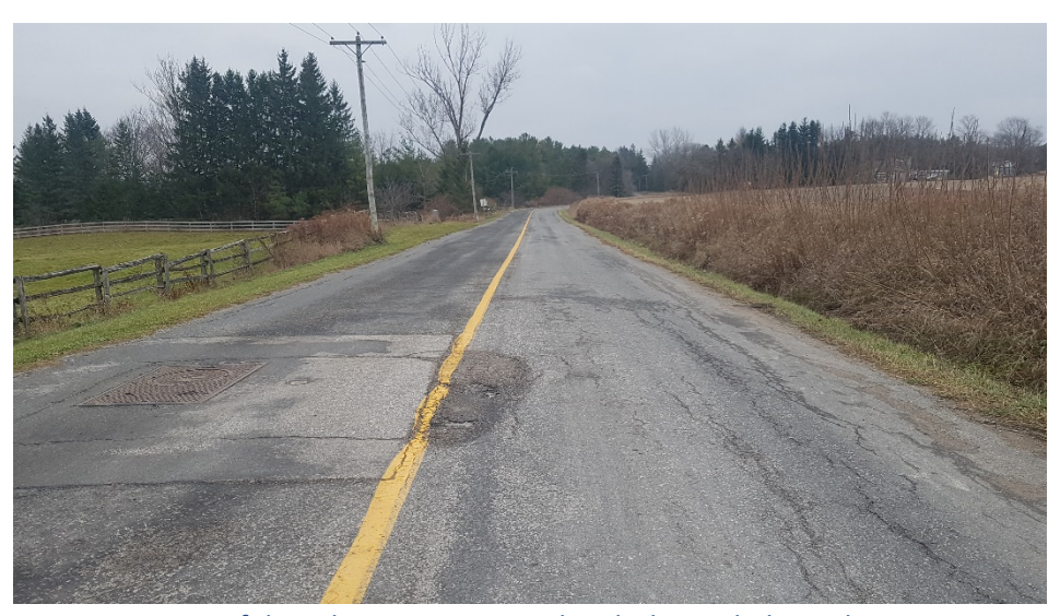
Image 14: View of disturbances associated with the asphalt roadway. Note the cut and embankment of the road bed within the surrounding slightly sloping terrain. Lands beyond the disturbed road ROW retain archaeological potential.