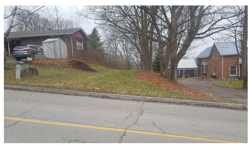
Image 29: View of steeply sloping terrain between two residential properties.