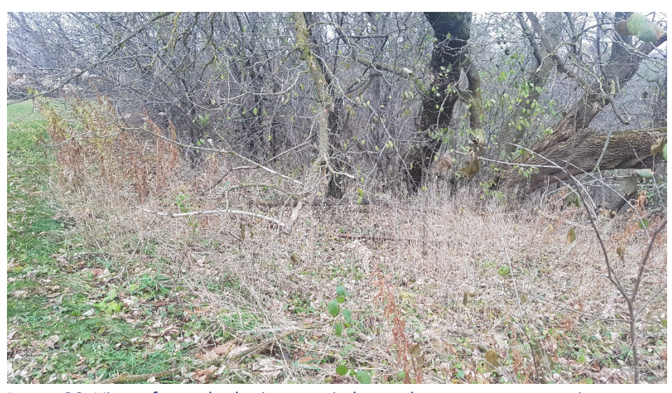
Image 30: View of steeply sloping terrain beyond overgrown vegetation (looking at the base of tree trunks on lower terrain compared to the terrain on which the field reviewer stands).