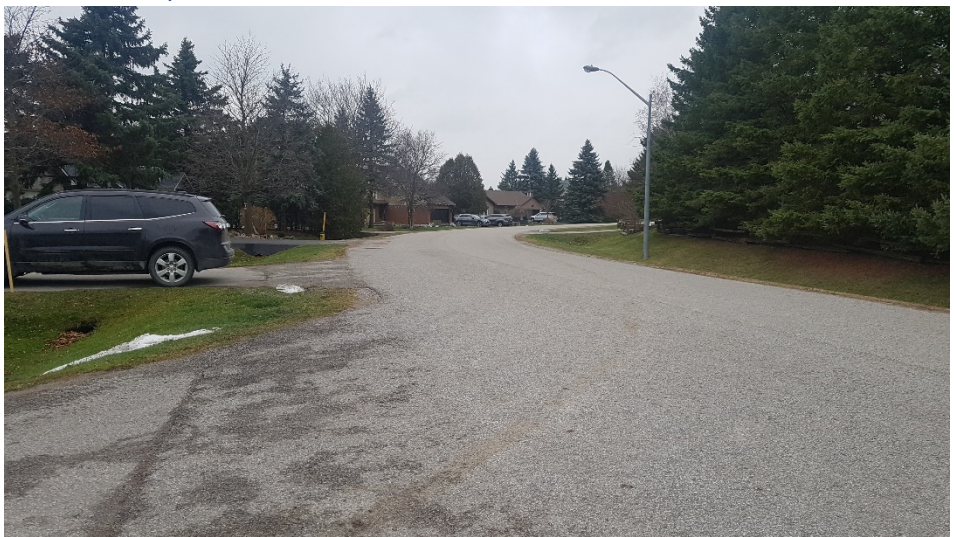
Image 8: View of disturbances associated with an asphalt roadway, intersecting driveways, deep drainage ditching, culverts, and residential structures.