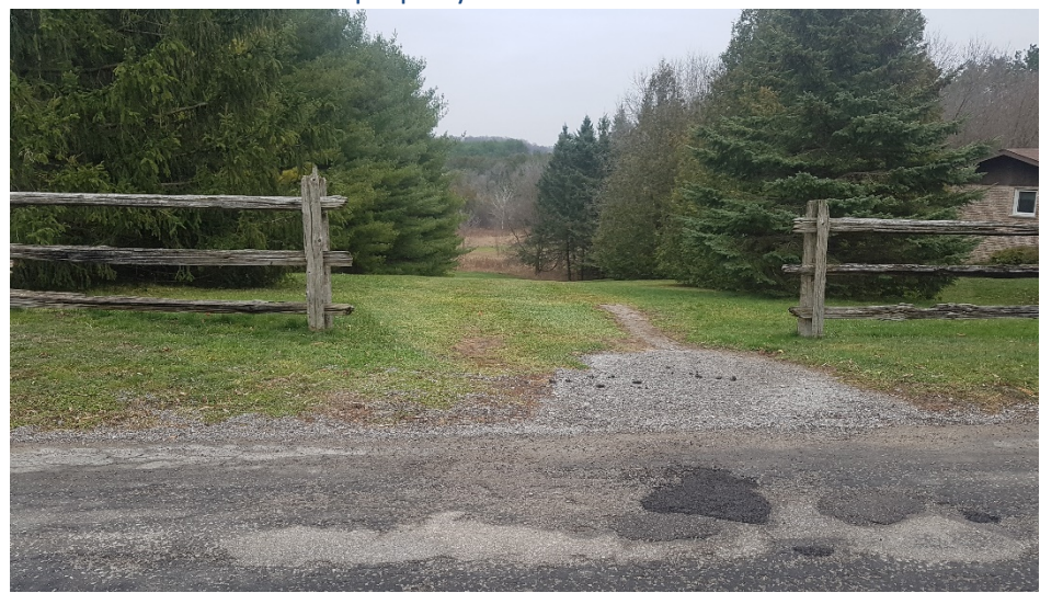
Image 36: View of area of archaeological potential beyond the disturbed ROW. Steeply sloping terrain visible in the background.