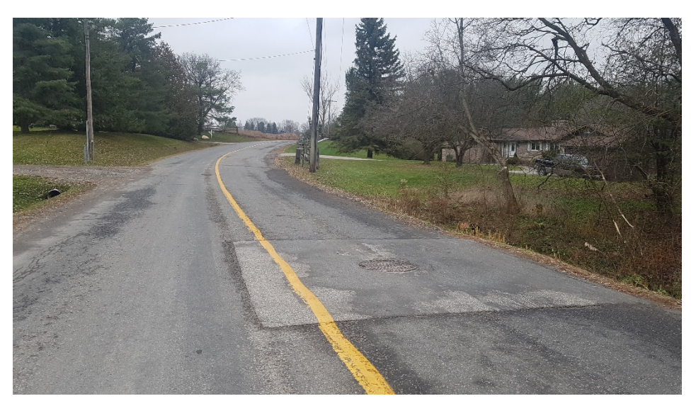
Image 17: View of disturbances associated with the asphalt roadway, intersecting driveways, roadside ditching and residential structures. Manicured lawns retain archaeological potential.