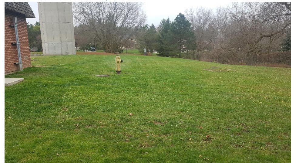
Image 7: View of area subjected to previous grading and construction activities associated with the installation of various buried utilities.