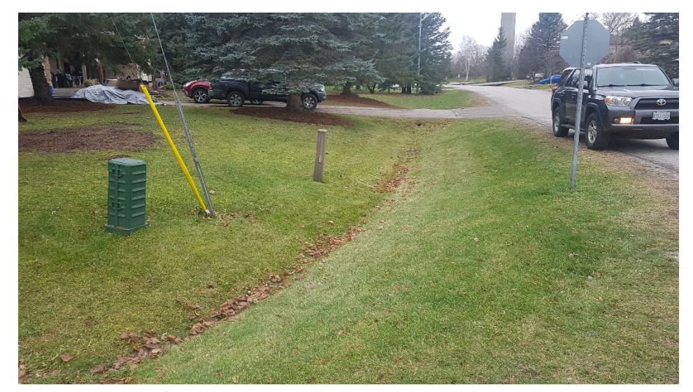
Image 11: View of disturbances associated with an asphalt roadway, intersecting driveways, various buried utilities and deep drainage ditching. Lands beyond the disturbed road ROW retain archaeological potential.