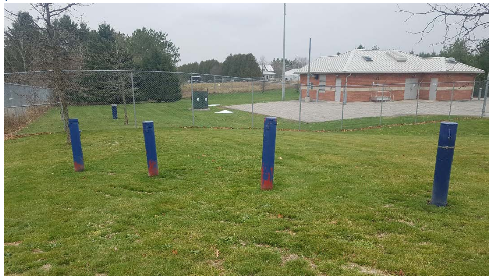
Image 20: View of area subjected to previous grading and construction activities associated with the installation of the well site.