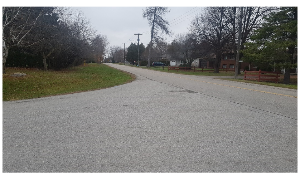
Image 10: View of disturbances associated with asphalt roadways, intersecting driveways and residential structures. Manicured lawns retain archaeological potential.