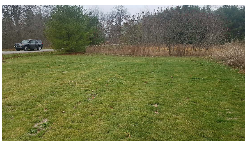
Image 22: View of area subjected to previous grading and construction activities associated with the installation of the well site.