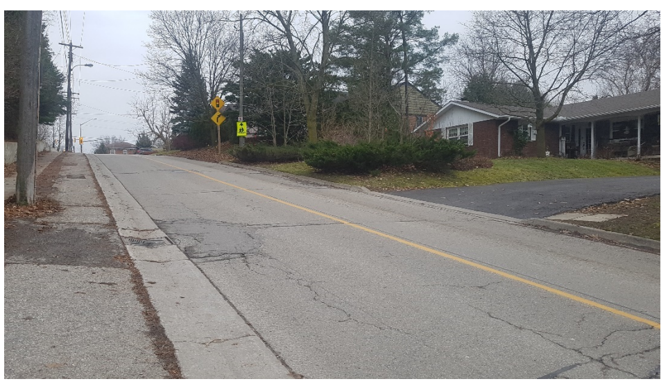
Image 2: View of disturbances associated with the asphalt roadway, concrete shoulder and curbs, intersecting driveways and residential structures.