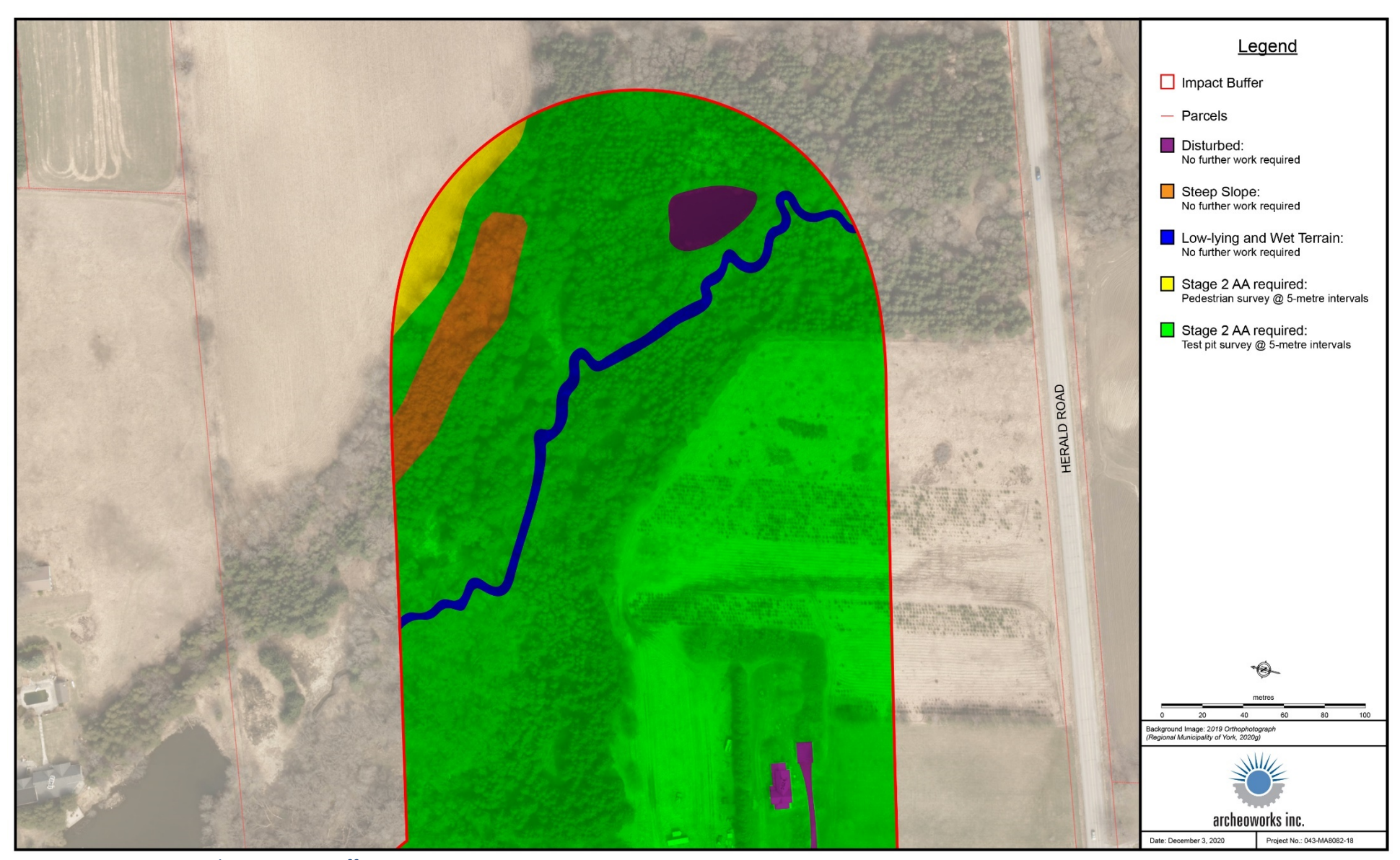
Map 17: Stage 1 AA results – Impact Buffer.