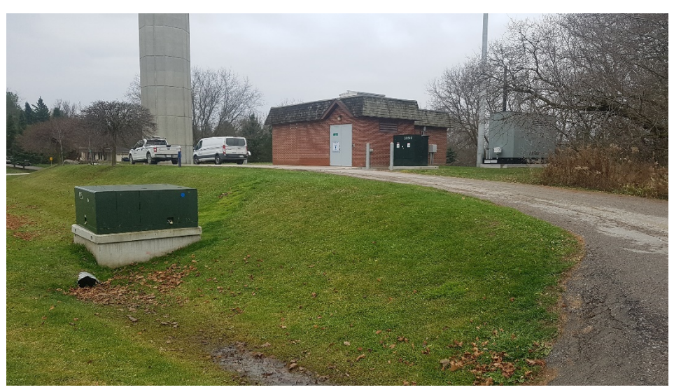
Image 6: View of disturbances associated with deep drainage ditching, an asphalt driveway and regional infrastructure (Mount Albert wells 1 and 2 and elevated tank).