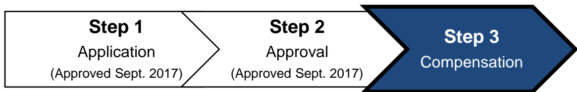
Figure 1 Council Approval Steps

This report is for the third and final step in the expropriation approval process. Figure 1 below summarizes the three steps in the process for obtaining approval by Council for expropriation. Upon approval by Council of this step, completion of the process will involve the Region serving an offer of compensation to the owner and obtaining possession of the land requirements.