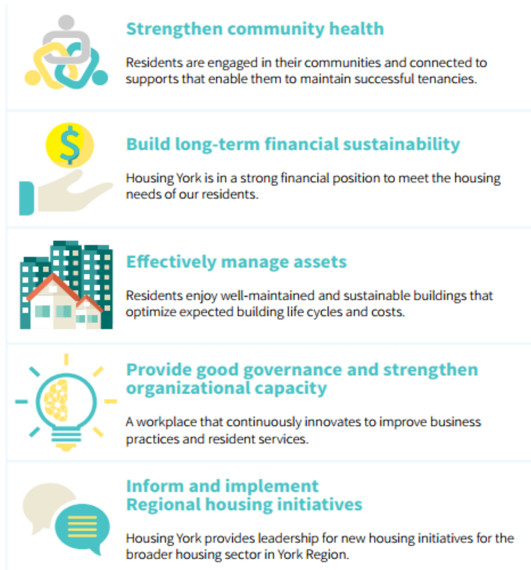
Figure 1 Housing York’s Strategic Directions

In November 2016 , the Board released Housing York’s 2017 to 2020 Plan Achieving New Heights Through Innovation and Sustainability . It builds on its strong foundation as a progressive housing provider and embraces the innovative through a balanced set of strategic directions, outlined in Figure 1.