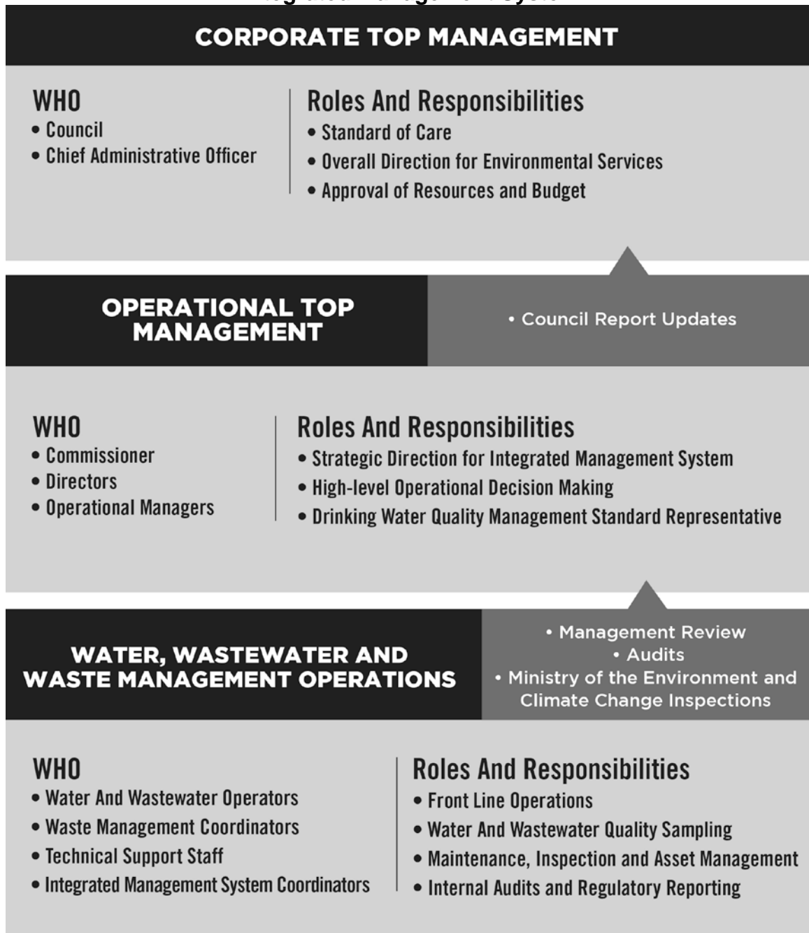
Figure 1 Roles and Responsibilities for Environmental Services Integrated Management System