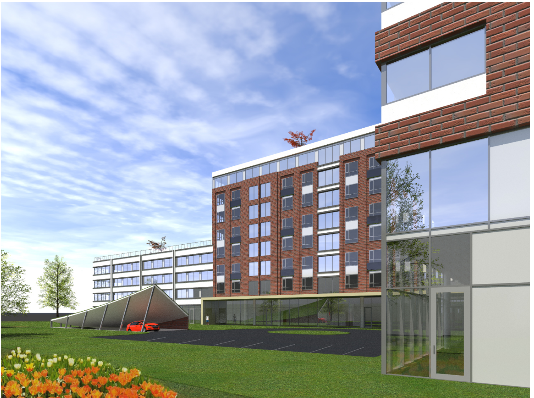
View looking North West