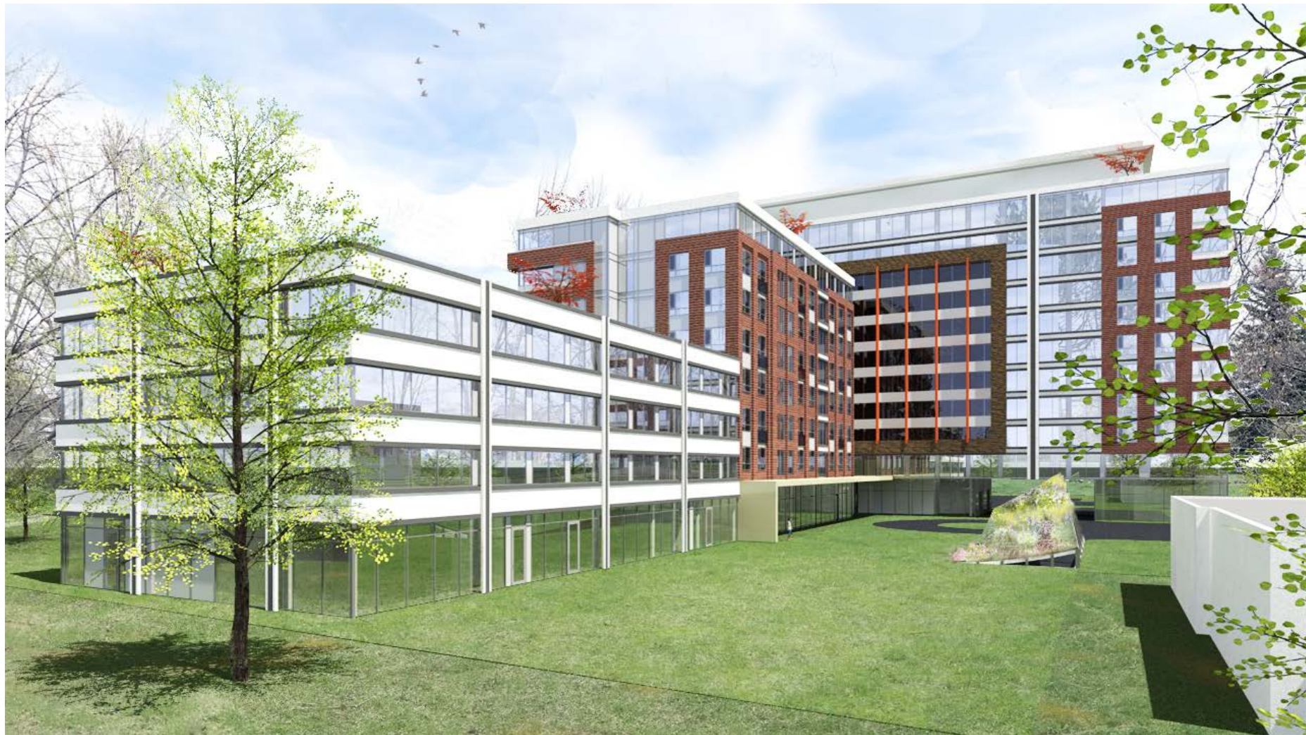
View looking East