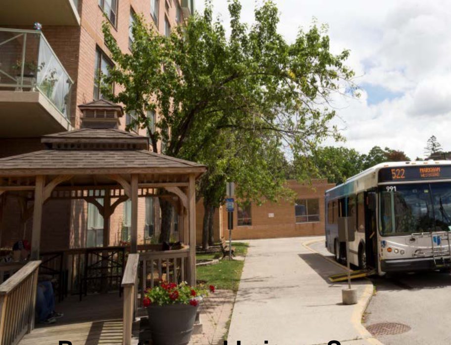
Recreation and Leisure Space