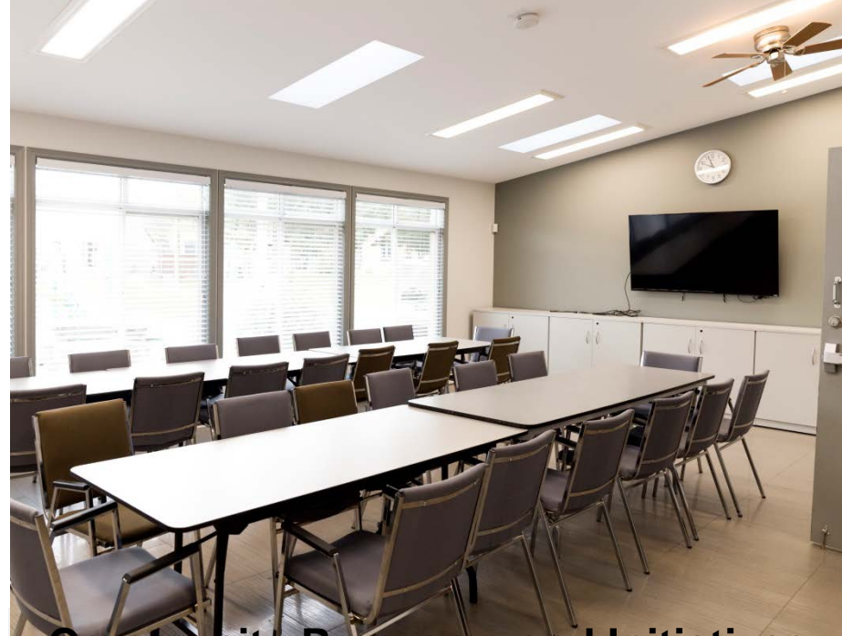
Community Programs and Initiatives