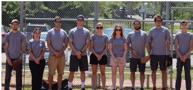
Summer Student Program