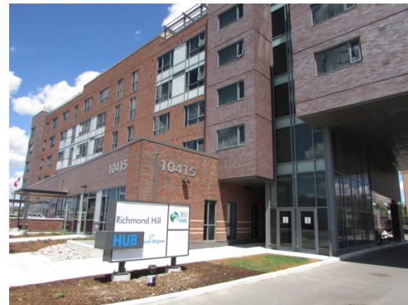
Richmond Hill Hub