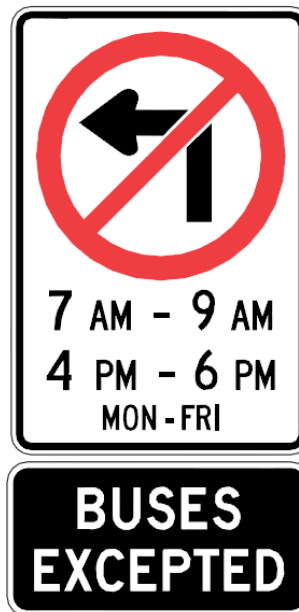
Figure 1 Buses Excepted Tab and No Left Turn Sign with Day and Times