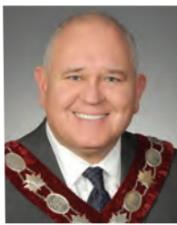
Mayor Frank Scarpitti City of Markham