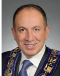
Mayor Maurizio Bevilacqua City of Vaughan