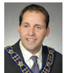
Mayor Justin Altmann Town of Whitchurch-Stouffville