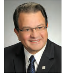
Regional Councillor Vito Spatafora Town of Richmond Hill