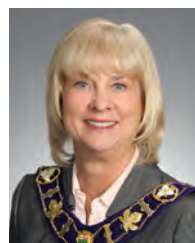
Mayor Virginia Hackson Town of East Gwillimbury