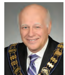
Mayor Tony Van Bynen Town of Newmarket