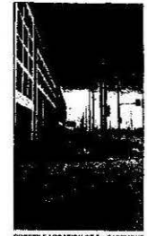
POSSIBLE LOCATION OF THE EASEMENT AT FRONT OF ROYAL 7 DEVELOPMENT