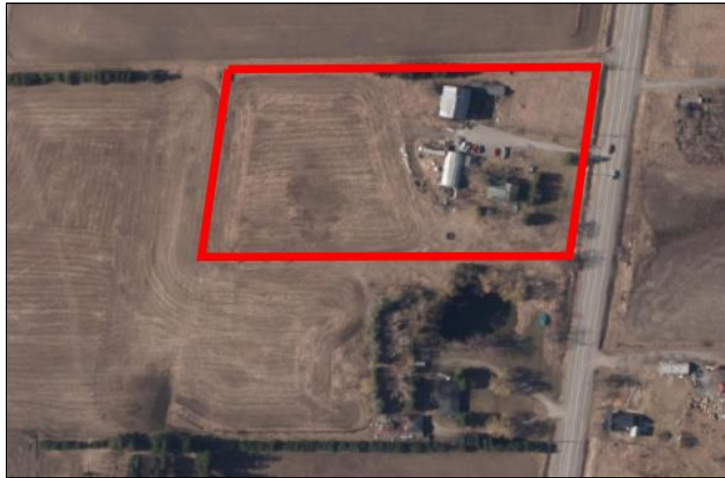
Figure 1: Aerial photo of subject lands