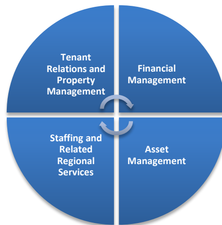
Figure 1 – Current Business Areas

Housing York actively monitors and manages key risks. Attachment 1, Key Risks Currently Being Monitored and Managed , provides examples and identifies risks and related mitigation strategies.