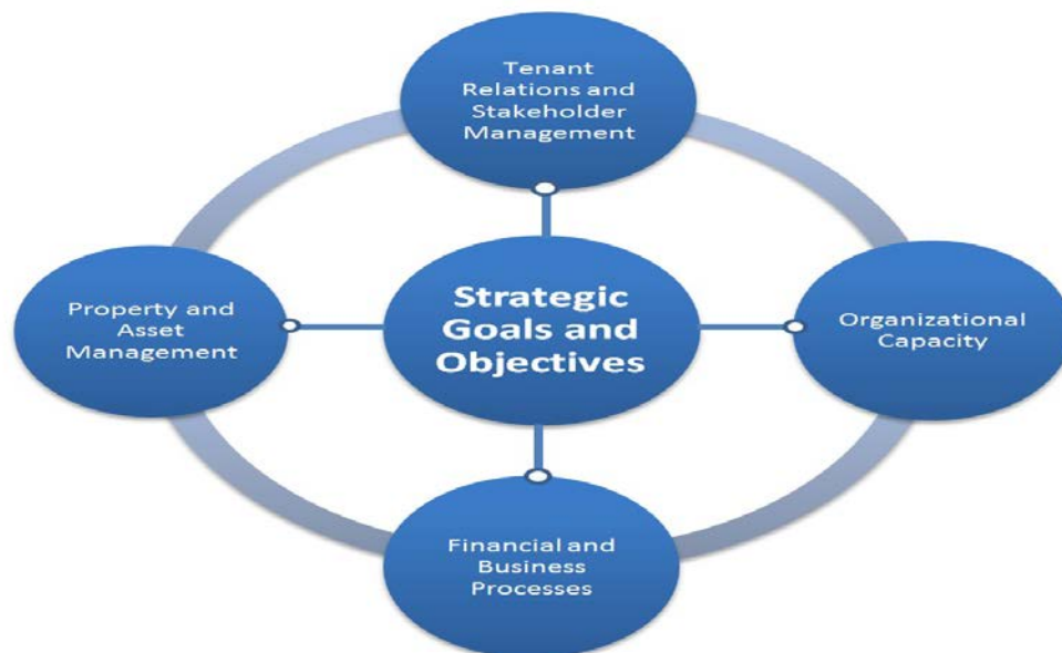
Figure 3 – Potential Key Business Areas

The new system will continue to identify and manage risks in the corporation’s key business areas. These areas will be confirmed during the final stages of Housing York’s strategic Multi-Year Plan to ensure alignment with strategic directions and priorities. Figure 3 provides an overview of the potential key business areas and related risk considerations.