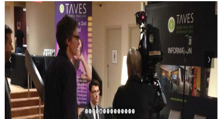
Discover Canada's Ultimate Consumer Electronics Show

Oct 30 – Nov 1, 2015 | Sheraton Parkway Toronto North Hotel & Suites