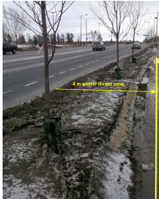
Figure B. Schubert cherry planted inside the “winter threat zone”. Only a small assortment of species planted by the Region, not including cherry, can tolerate the physical and chemical impacts related to winter roadway maintenance and vehicle traffic.

Soil fertility in Regional road allowances has been identified to be unsatisfactory for trees as determined through laboratory testing. This corresponded to low foliar nutrition. The two most commonly deficient foliar nutrients were iron (84% of the samples), and nitrogen (80%). The laboratory attributed the deficiencies to high soil alkalinity, inadequate supplies of nitrogen, phosphorus, potassium and iron. Significant deficiencies in soil fertility were measured in phosphorus (100% of the samples), and