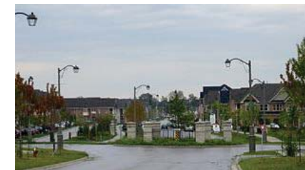
— Local Roads

An integrated network is key to meeting Vision 2051