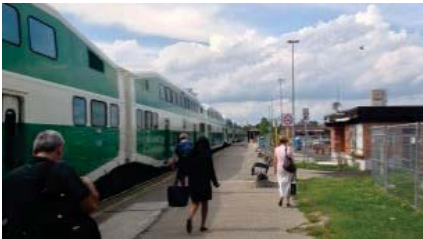
— GO Transit Lines