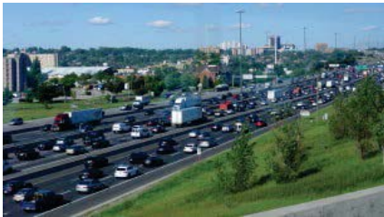
— Provincial Highways