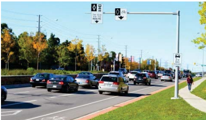
— Regional Roads