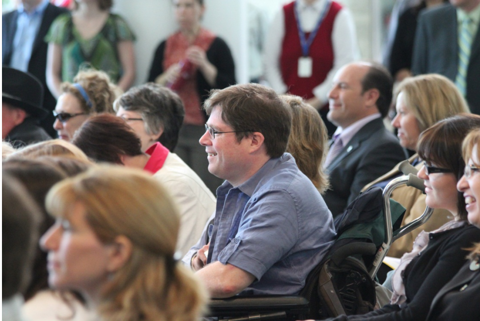
National Access Awareness Week 2011