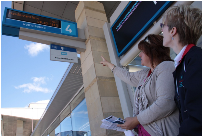
YRT/Viva MyRide Travel Training Program