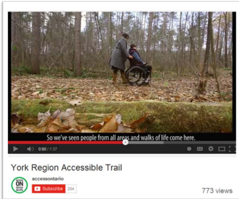
Accessible trail video on Ministry website