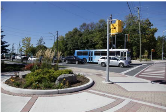
Keele Street and McNaughton Road