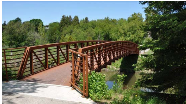
Nokiidaa Trail Connection in East Gwillimbury