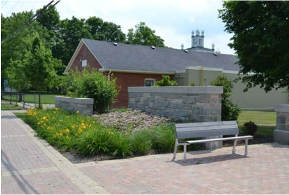
Leslie Street and Mount Albert Road