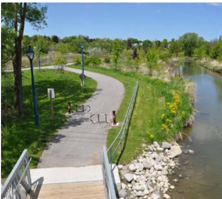
Tom Taylor Trail Mulock Drive Underpass in Newmarket